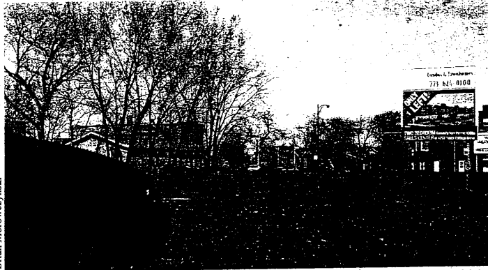
This lot at 43rd Street and Drexel Boulevard is currently vacant but could be developed into 48 new townhouses.